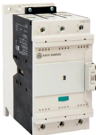
RADE KONCAR CONTACTOR CNN150 150A/75kW (AC3, 400V/50Hz); 160A(AC1) In conformity with standard IEC 60947-4-1