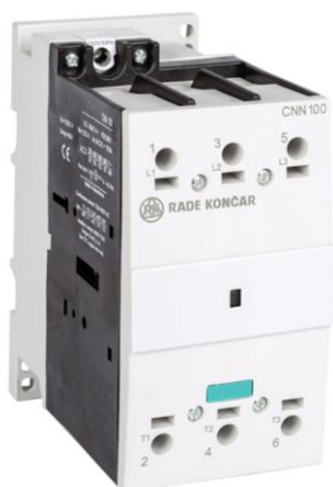
RADE KONCAR CONTACTOR CNN100 100A/55kW (AC3, 400V/50Hz); 115A(AC1) In conformity with standard IEC 60947-4-1